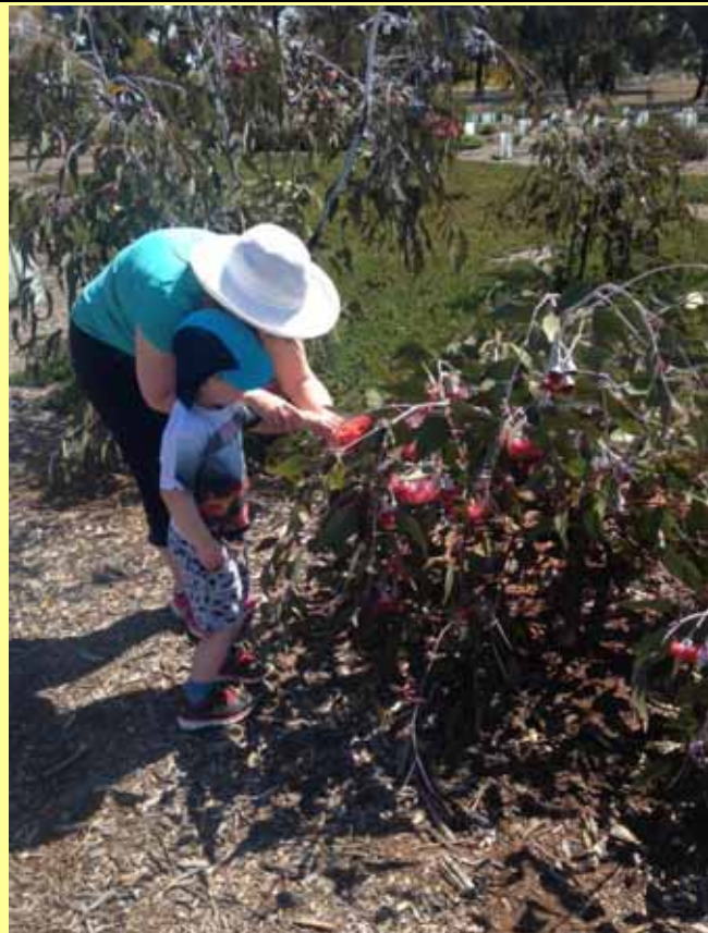
Visitors admiring Eucalyptus caesia subspecies Magna or Silver Princess