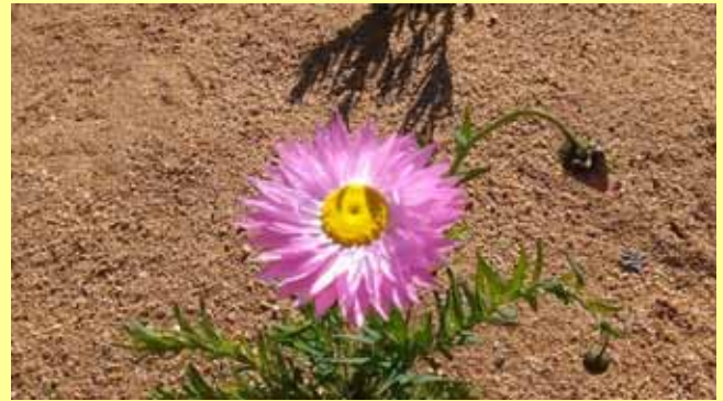
Rhodanthe chlorocephala or Paper Daisy