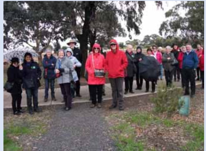
Some of the visitors on the tour.

It was a cold day but we enjoyed morning tea together and the group had time following the walk to purchase plants at the Nursery. We also received a sizeable donation from the group which will help build the garden.