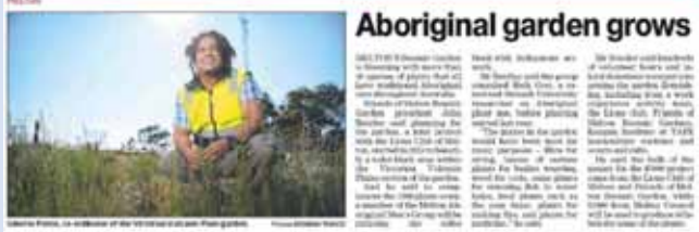
A Western Water Community Grant to the Lions Club of Melton helped to provide most the plants for this Victorian Volcanic Plains Garden at the Melton Botanic Garden. The garden is looking spectacular right now.