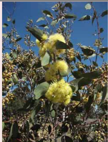
Eucalyptus Torwood Natural hybrid from E.torquata and E.woodwardii