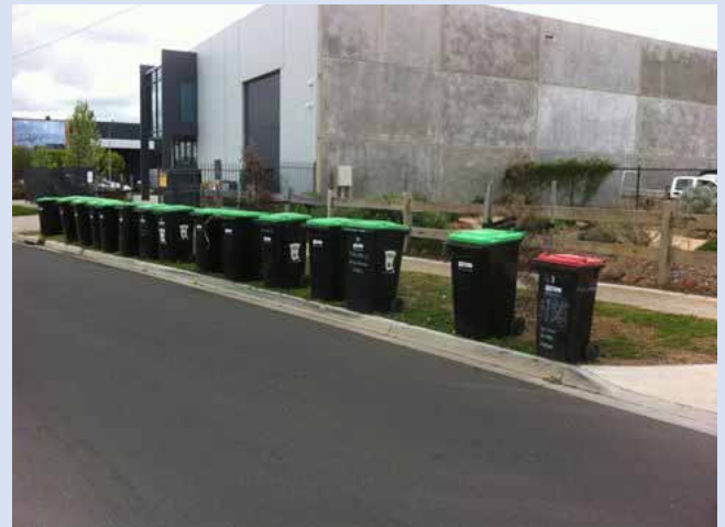
MBG bins outside the depot ready for collection