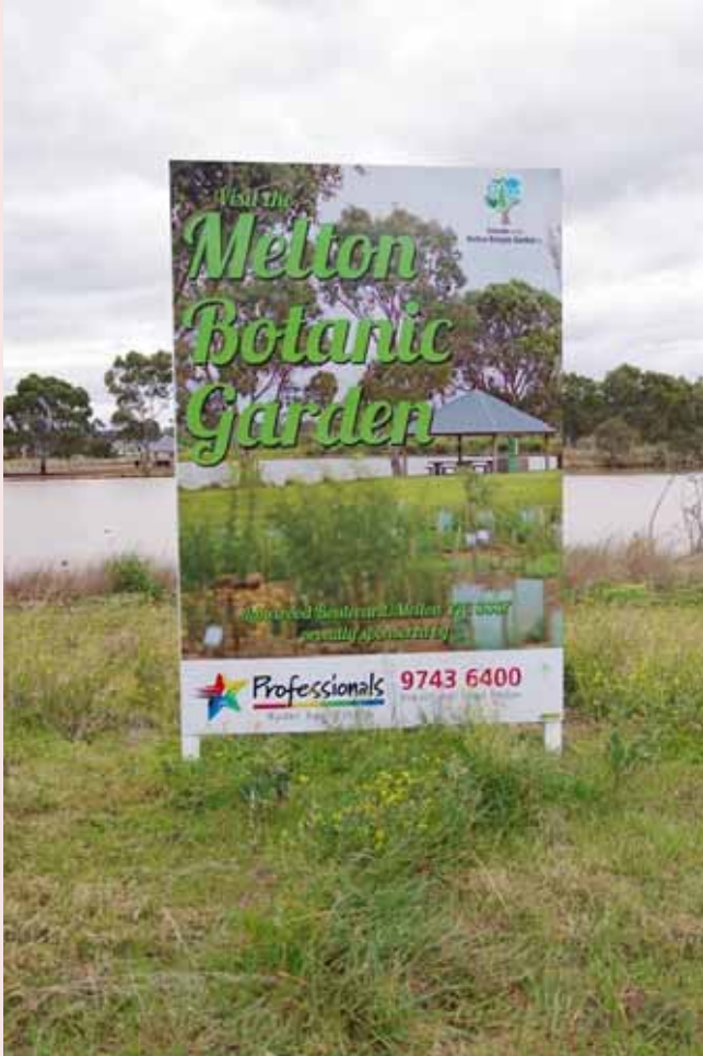
Real estate sign facing the Western Highway kindly designed, printed and installed by The Professionals Ryder Real Estate Melton