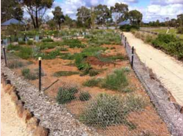
Grassland section Thursday 10 Sept 2015

This garden survived on the low Melton rainfall over summer after being planted July to Sept 2014. The province of the seeds are from Melbourne's west and plants were purchased from Newport Lakes Native Nursery.