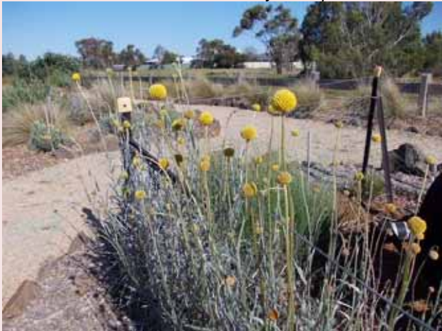
Drumsticks ( Pycnosorus globosus )